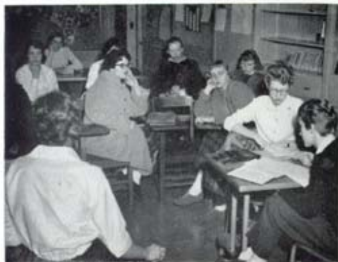
"The minutes for the last meeting are . . ."

As an organization, Thespians has been busy this year. Homecoming, our main fall activity, was very successful. We changed many of the former customs, and the new system worked well.