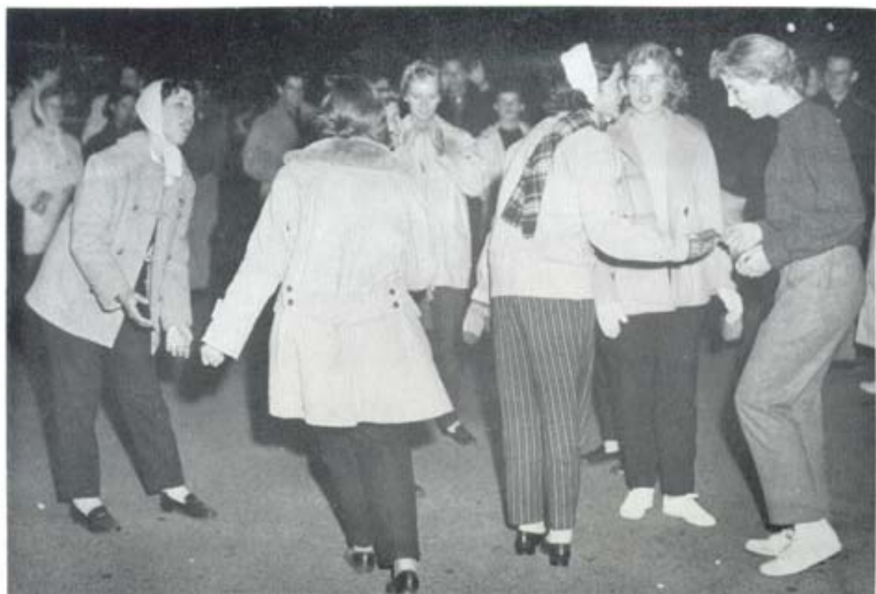
Get the beat—Homecoming street dance