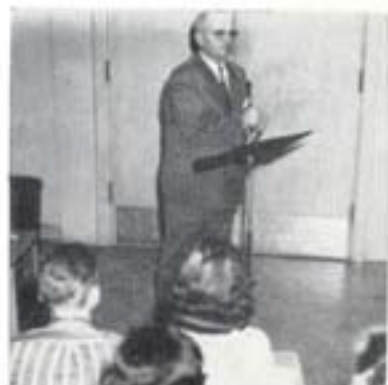
Speaker of the evening