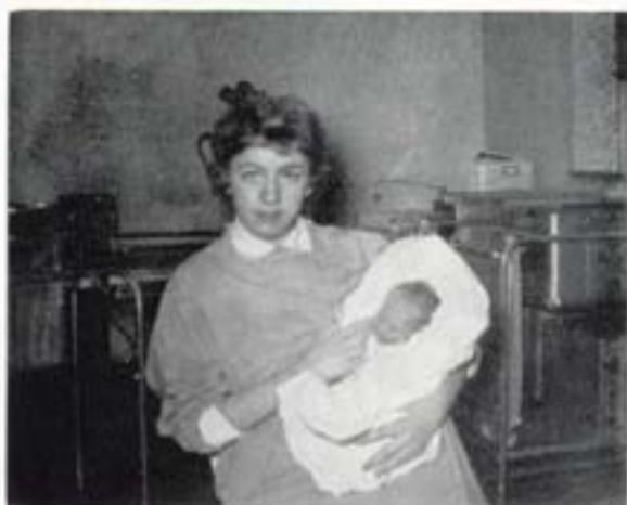
Nursery—a favorite place to work