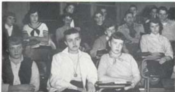
This is serious