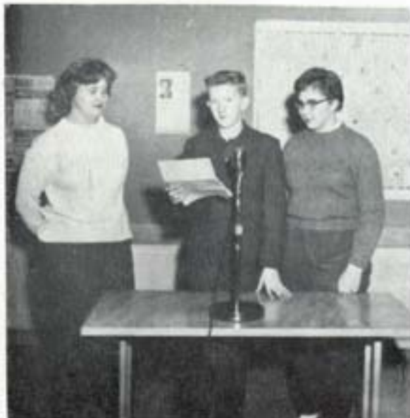
Rehearse, rehearse, rehearse