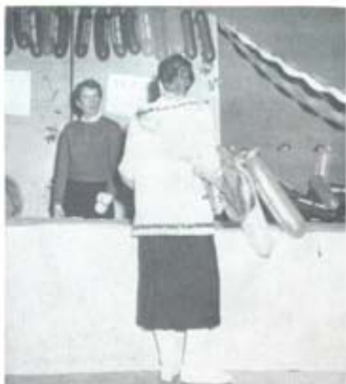
"Play it here, three for a dime"