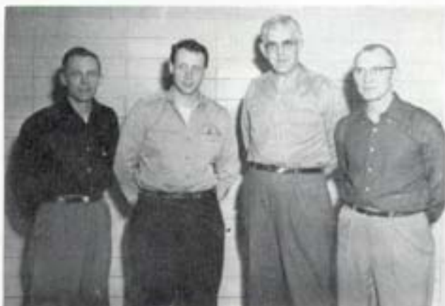
Four good shots