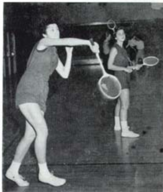
Come on, you can hit it