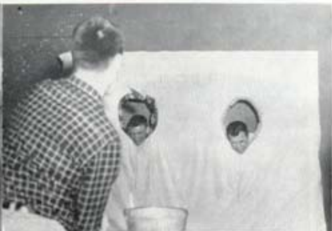
One, two, three splash