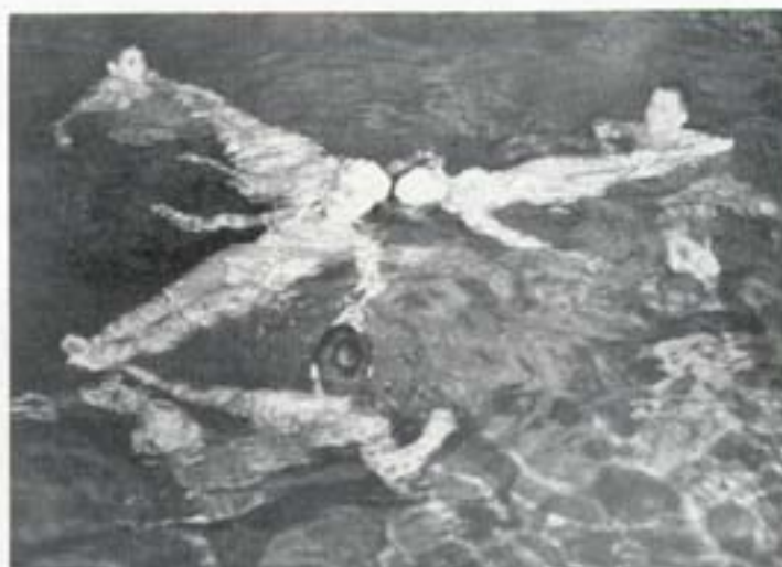
Snow Princess Bottoms up