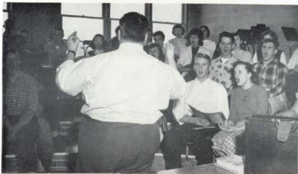
Sing; Sing; Sing