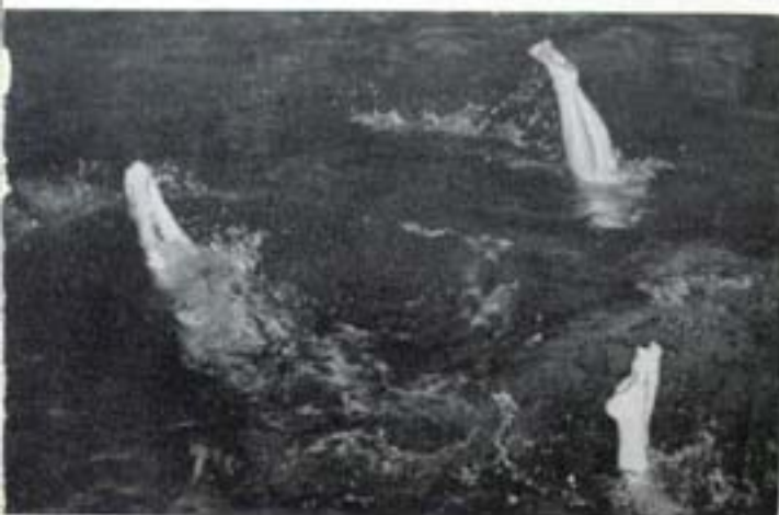
There they go