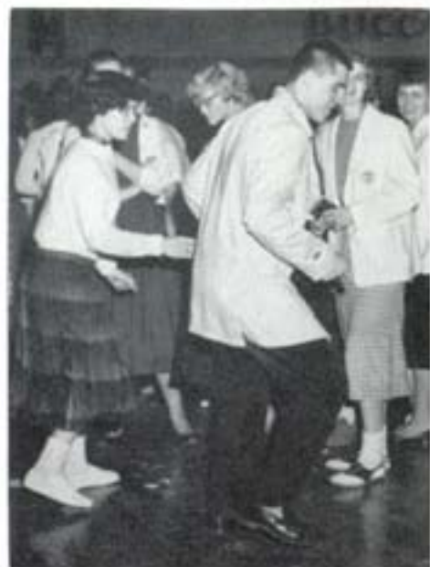
They've got the beat