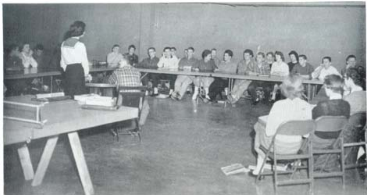
Where business gets done?