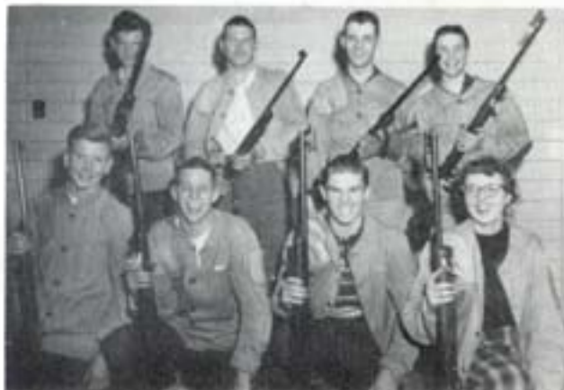
A happy team