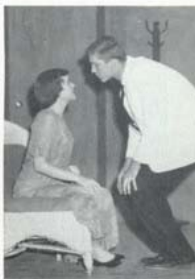
Well, Leo, what is it?