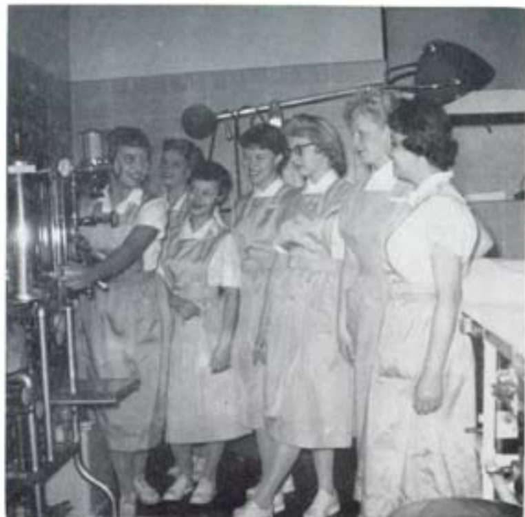
"This is how it works"