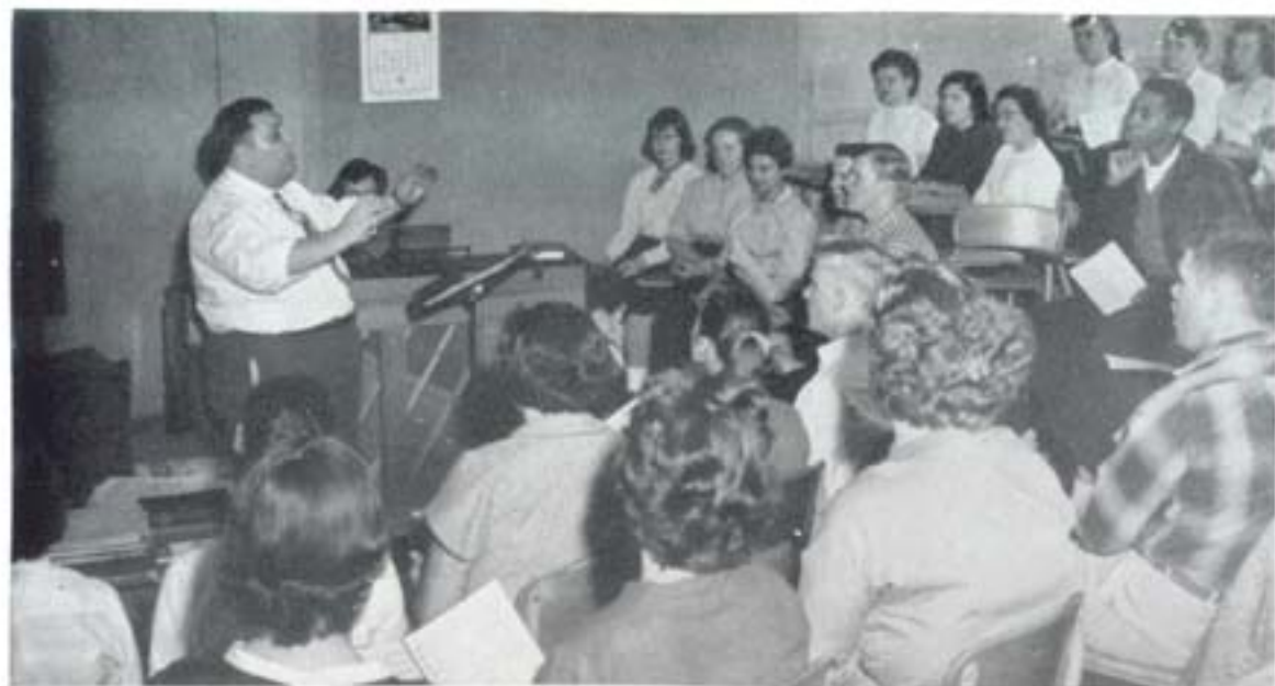
Practice makes perfect