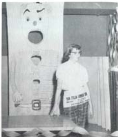
"Won't someone play this game?"