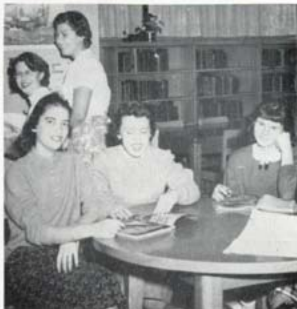
It's all in the book

The student librarians enjoy being of service to students and faculty, and also enjoy some good times together. Annual parties are held at the Public Library and with the Junior High Group.