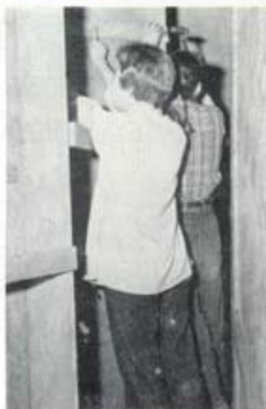
Get that nail in straight