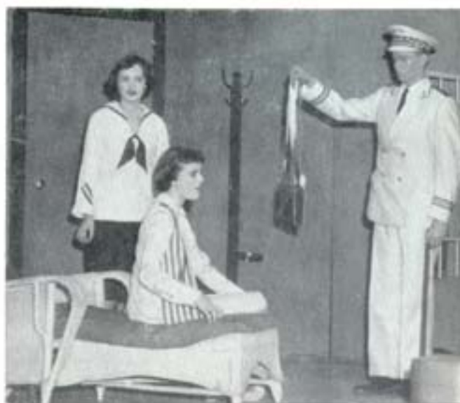
They want to be famous