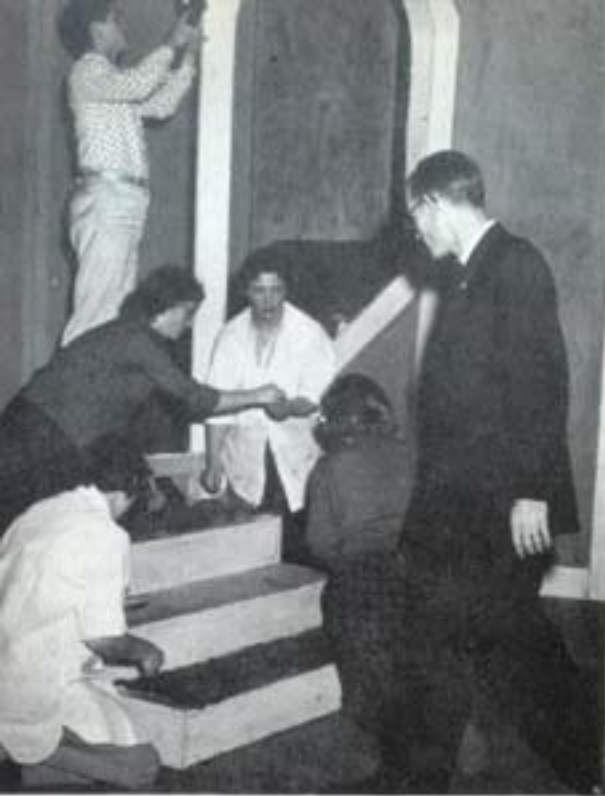
Half an hour before curtain on final dress rehearsal.