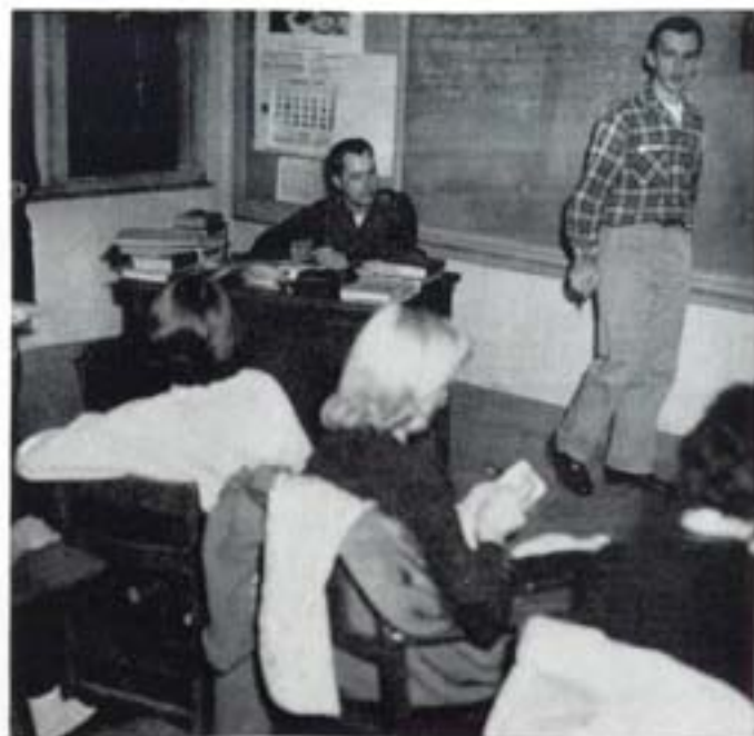
This is the situation

During the past year our Hi-Crier staff has worked hard to produce a paper which, you, the students, would be proud of. The Hi-Crier is becoming more and more mature in experience and writing. With the support of the student body, we can look forward to having more successful years.