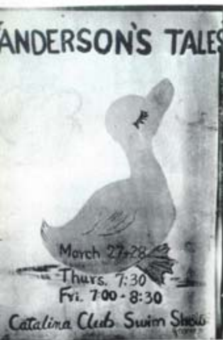
Catalina Club presents