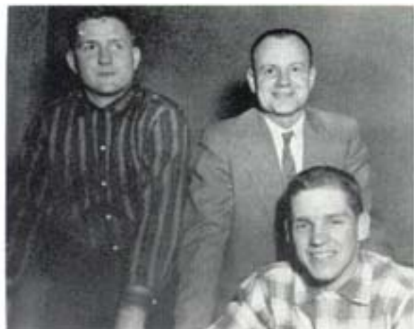
They're happy about something.