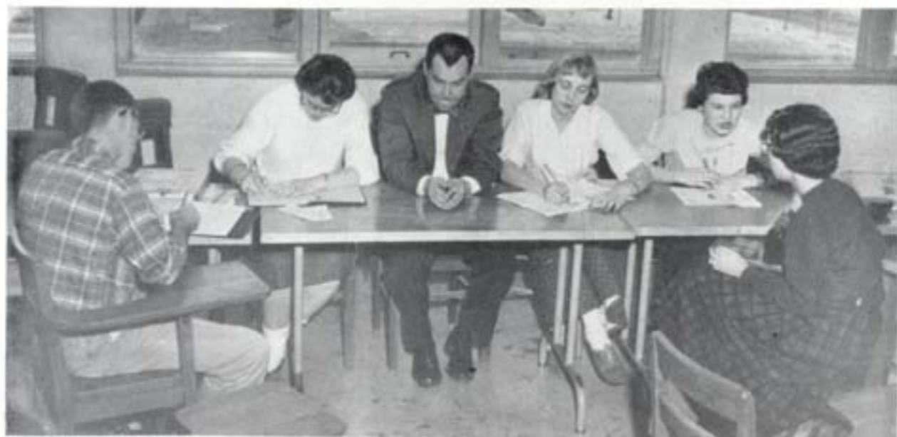
It takes concentration