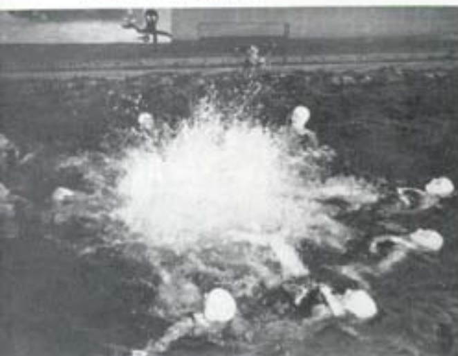
The big splash One, two, three, jump!