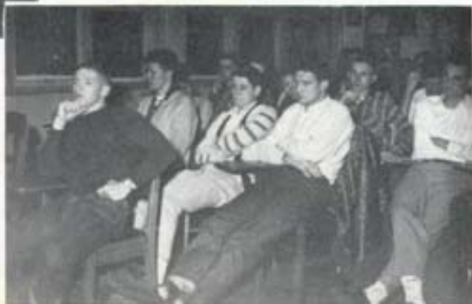
Think hard, boys