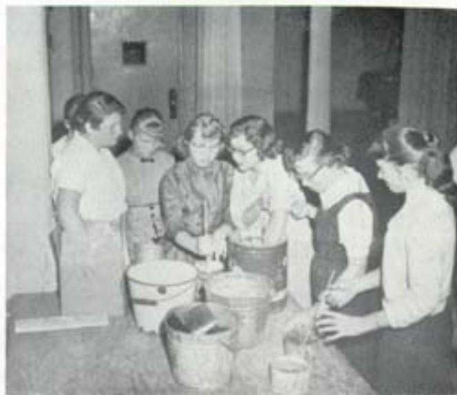
Prospective Thespians work for points