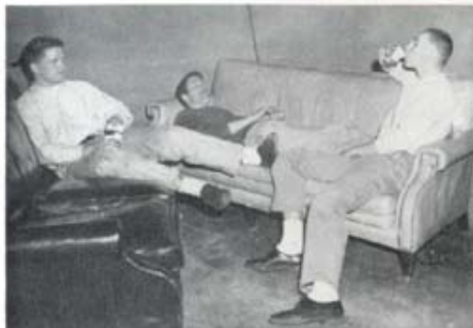
A well earned rest.