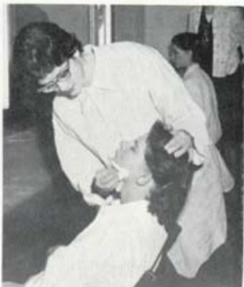
Oops, too much base.