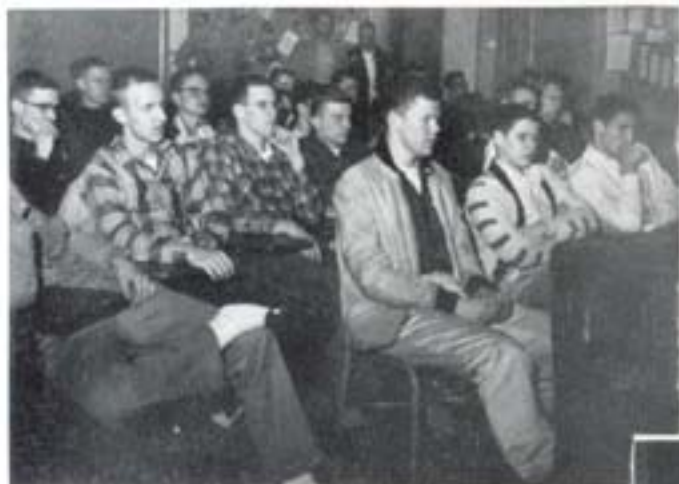
Important decision coming up