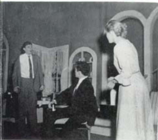
"I'm so mad I could spit."