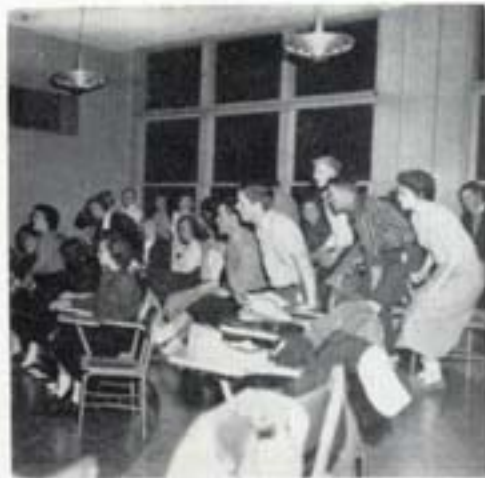
Time to go?