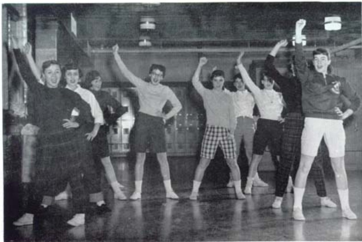
That's it girls. Really shout.