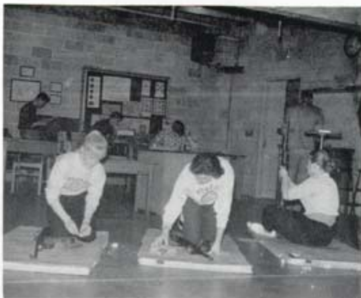
On the line