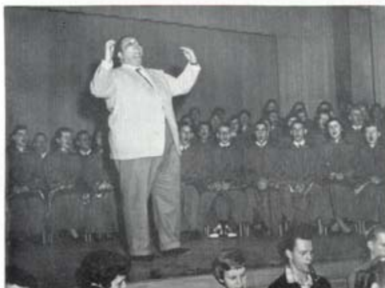
With voices like angels