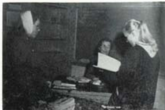
Mission accomplished; project completed