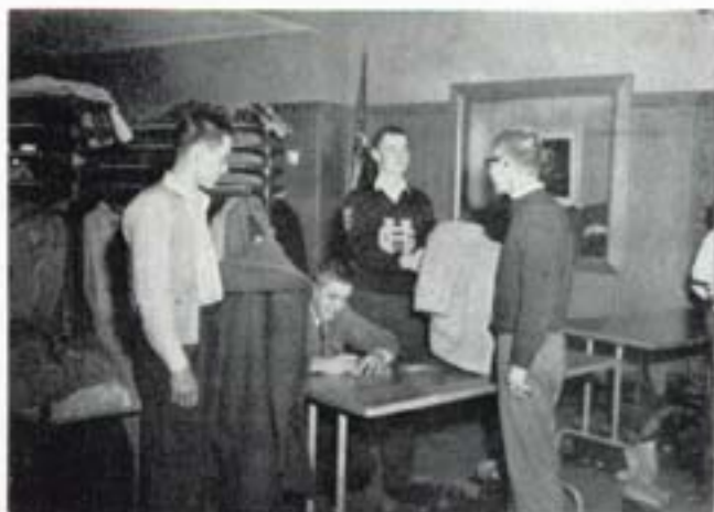
One coat, coming up.