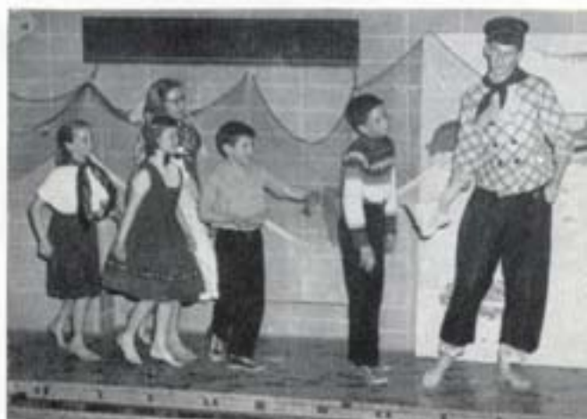
Hans Christian Anderson and friends