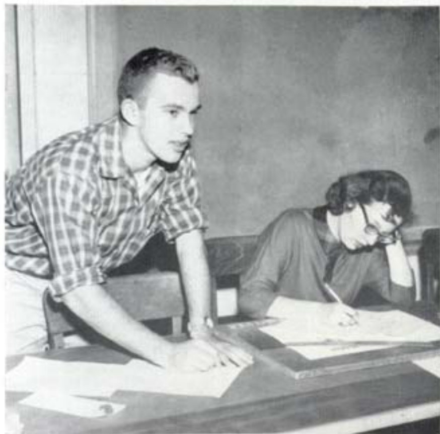
Well, what next?