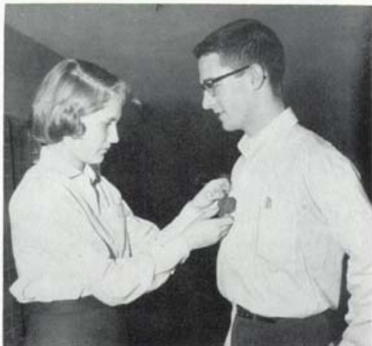
Caught on "Twirp Day"