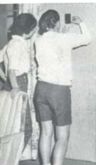
There's the light