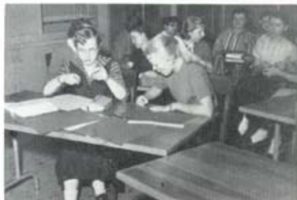
Project in the making