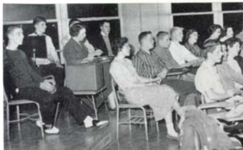
Sing a little louder