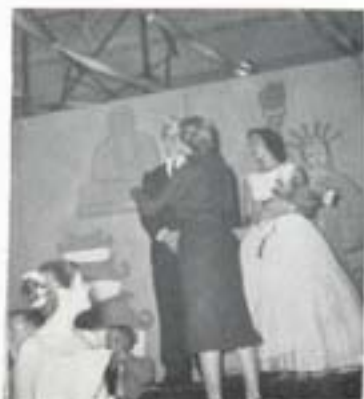
I crown you king.