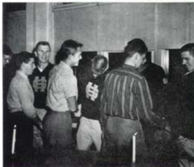
They're in now